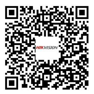
Figure 4-1 QR Code of Control Client User Manual

You can refer to the Chapter 2 Login and Chapter 30 Broadcast after scanning the following QR code for the detailed operation of HikCentral Professional Control Client.