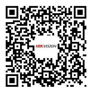
Figure 3-1 QR Code of Web Client User Manual

You can refer to the Chapter 2 Login and Chapter 34 Broadcast Management after scanning the following QR code for the detailed operation of HikCentral Professional Web Client.